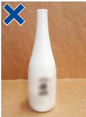
Example of a white bottle. Please put out with Landfill .