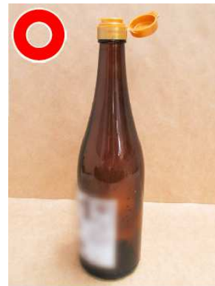
Rinse lightly and throw it out as is.