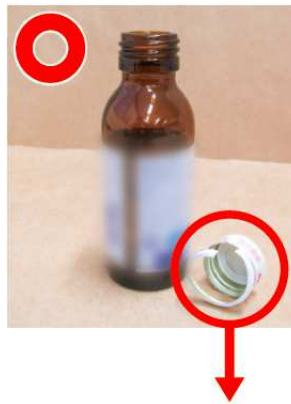
Remove the metal cap and put in Landfill .