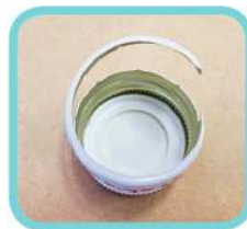
Cap from a drink bottle

← As seen in the photo, the inside is not made of metal and should go to Landfill .